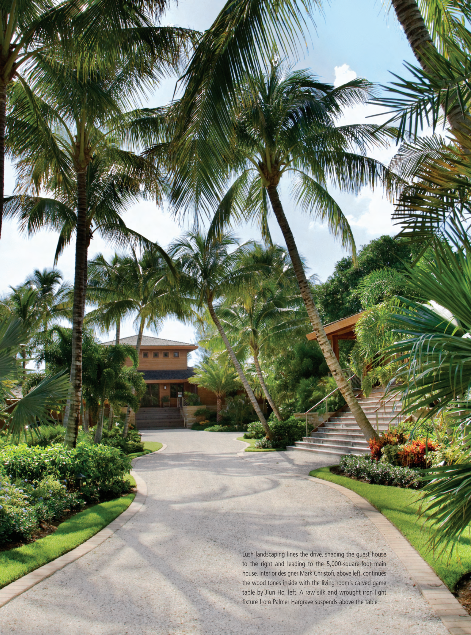
Lush landscaping lines the drive, shading the guest house to the right and leading to the 5,000-square-foot main house. Interior designer Mark Christofi, above left, continues the wood tones inside with the living room's carved game table by Jiun Ho, left. A raw silk and wrought iron light fixture from Palmer Hargrave suspends above the table.